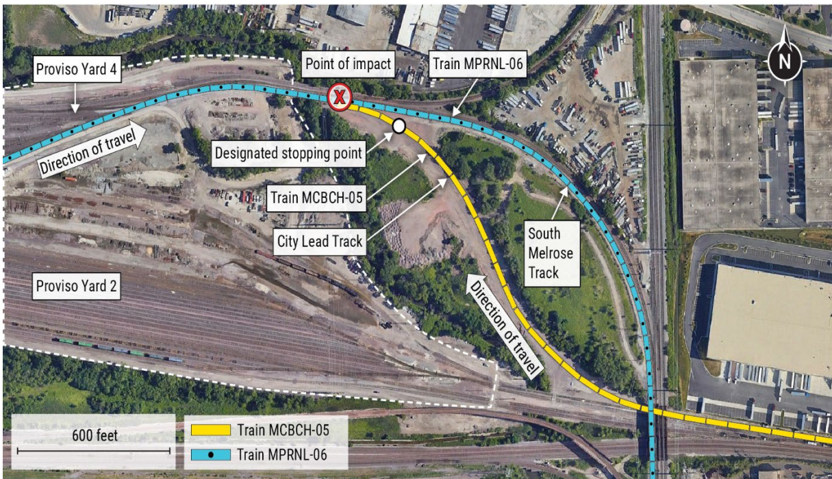
Figure 1. An aerial view of the accident site.

The striking train arrived at City Lead Track around 12:45 a.m., stopped movement, and radioed the Proviso Yard controller to await further instruction. 3 Shortly after, the Proviso Yard controller provided a job briefing to the two-person crew and instructed them to shove west down City Lead Track—a connecting track that merges with the South Melrose Track—and wait at the designated stopping point before entering Proviso Yard 4. (See figure 1.) As the crew of the striking train was receiving instructions from the yard controller, the departing train was simultaneously leaving Proviso Yard 4, pulling east on the South Melrose Track. The striking train was approved to shove into the yard and tie down after the departing train was safely clear of the merging point at City Lead Track and South Melrose Track. 4