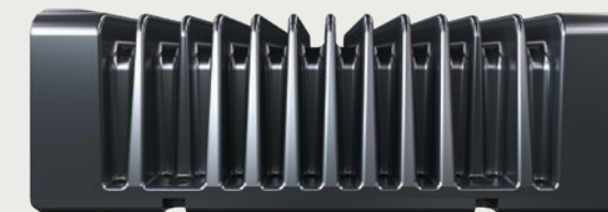
Airlink Mercury Side View