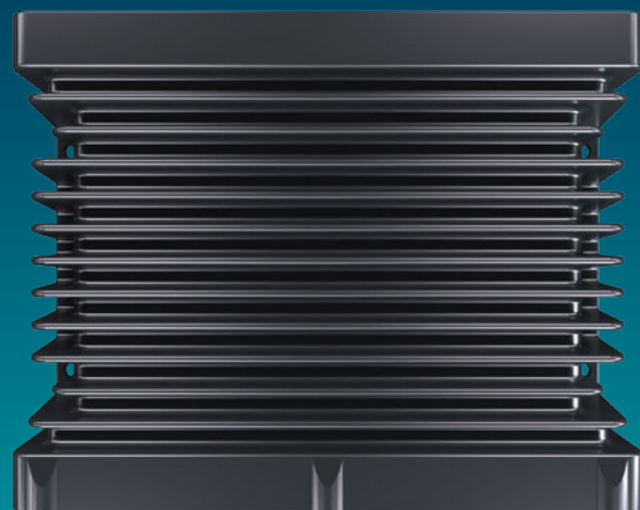
Airlink Mercury Top View