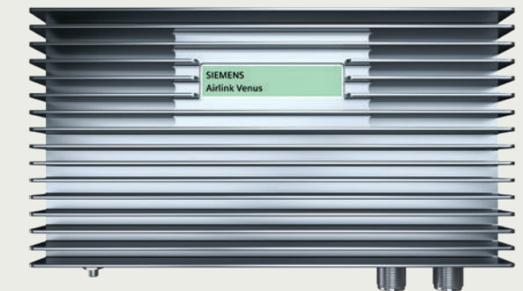
Airlink Venus Top View