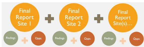
Figure 1. SLSI created 20 Assessment Reports in 2024.

SLSI collected and reviewed the 2024 SCA Reports (N = 20; 13 first time SCAs and 7 second or third time SCAs) (see Figure 1 ).