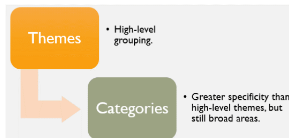
Figure 3. Overview of the data hierarchy

The strengths and opportunities for improvement in safety culture identified in the reports were reviewed, themed, and coded into a two-level categorical hierarchy (see Figure 3 ). The prevalence of themes and the categories that comprised them were then estimated by calculating their frequencies across reports. The high-level themes that were identified in these reports closely align with safety culture constructs that have previously been established in the scientific literature. These themes and their measures have further been adapted and used as part of the SCA process (Kidda & Coplen, 2016).