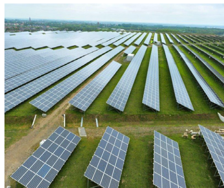
Example of Solar Array Field

Traction-power substations (TPSS) are responsible for converting power from multiple resources, to ensure availability and quality of traction power supplied to the Overhead Contact System (OCS). The OCS delivers electricity directly to the trains via overhead wires, enabling their operation on the rail network.