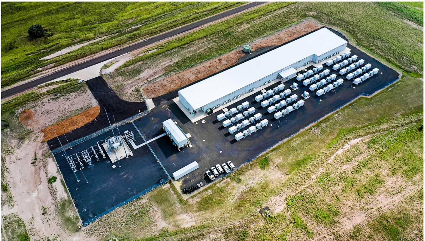
Example of Battery Energy Storage System Unit