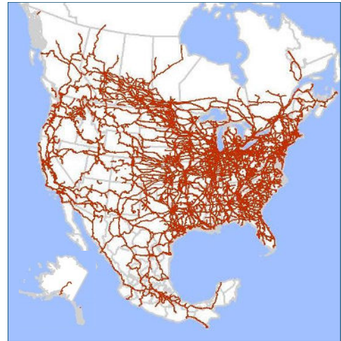
North America's Freight Rail Network

Meanwhile, rail intermodal — the transport of shipping containers and truck trailers on railroad flatcars — has grown tremendously over the past 30 years. Today, just about everything found on a retailer's shelves may have traveled on an intermodal train. Large amounts of industrial goods, such as auto parts, are transported by intermodal trains as well.